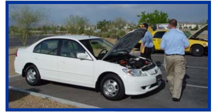
Honda Civic Hybrid Vehicle

More than 50 fleet operators and other interested parties attended the LVRCC symposium, “AFVs for Passenger Transportation on April 1. The event was sponsored by Clark County Department of Air Quality Management and Cummins Intermountain.