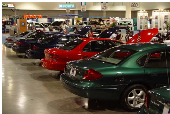
US GSA Auction at the 10th National Clean Cities Conference in Fort Lauderdale, FL.